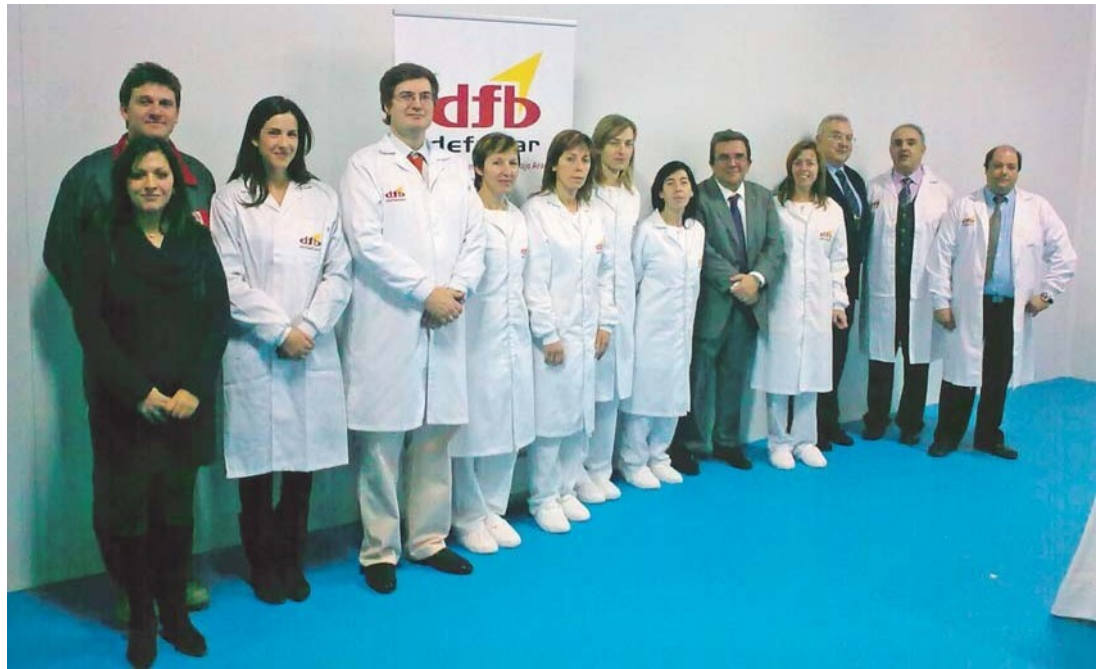
A part of our human equipment

We work to satisfy all your professional needs